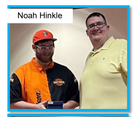
Personal Achievement Award Winners