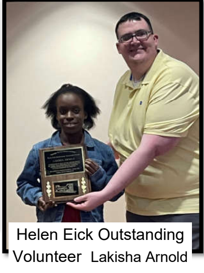
Developmental Disabilities Awareness Month March 2025