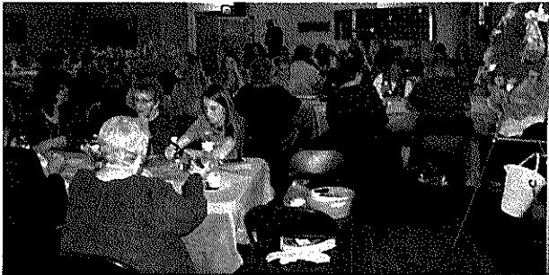
Longaberger Bingo 2018

Please watch Carroll County Caring Hands' Facebook page for announcements of upcoming fundraising events.